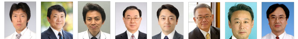
Executive committee members