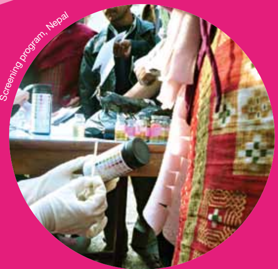
Screening program, Nepal